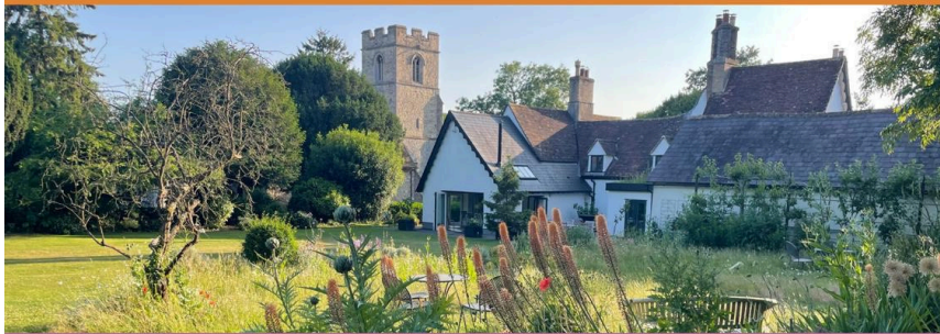
Caldecote Church, Main Street, Caldecote, Cambridge, CB23 7NU

https://fienta.com/the-new-sunrise-violin-and-cello-with-raffaele-and-goncalo