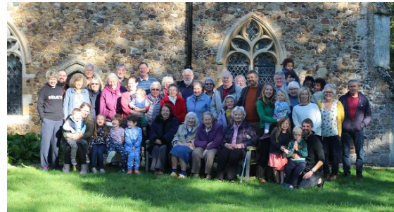
Some of the St Mary's Church Congregation, Summer 2023

The church family understands the importance of sharing the good news of Jesus, both in actions and words. Many of the members are involved in community organisations and groups, providing a positive impact on life in the village. The church's annual events, including coffee mornings and seasonal fairs, also bring the church into village life and vice versa.