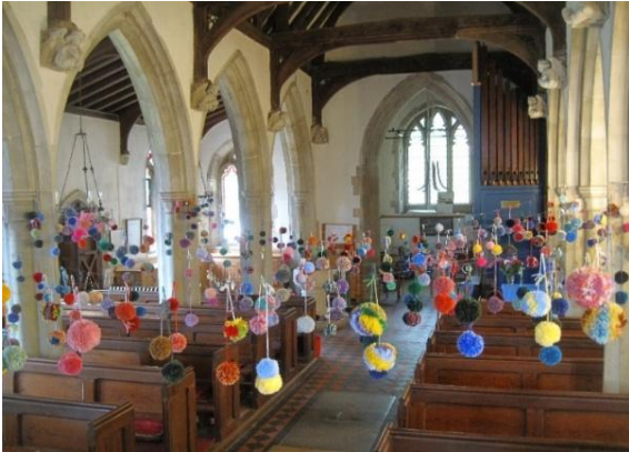
Spring Feast – St. Andrew's full of pom-poms