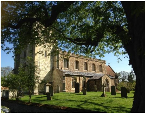
St Mary's Church, Comberton

The grade 1 listed church is situated on high ground about half a mile south of the village centre and dates from the 13 th century.