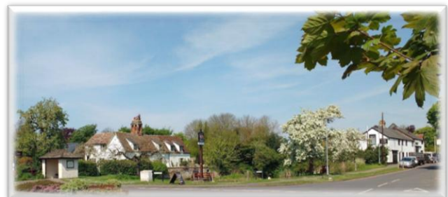
Comberton Village Centre

Comberton is an historic rural village approximately 6 miles west of Cambridge with a population of around 2,500.