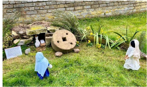
Easter Garden at St Mary's