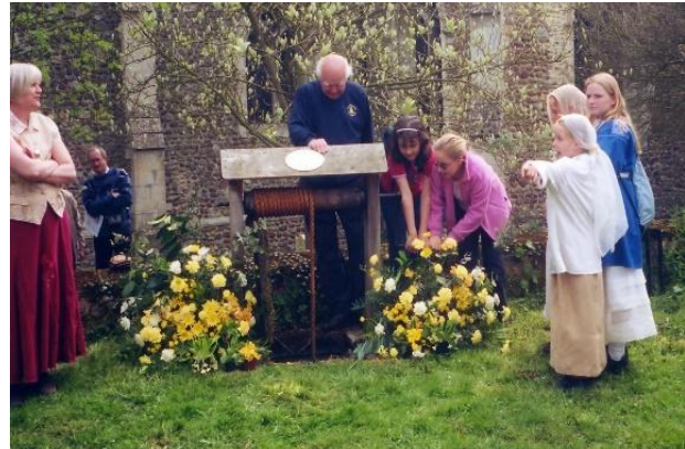
Spring Feast at the well