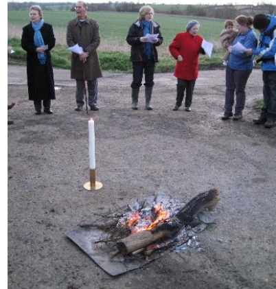
Easter sunrise service of light