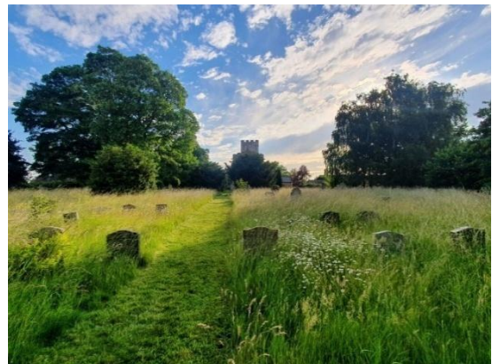
Spring Meadow at St Mary's

The parish own a small barn on land adjacent to the churchyard which is leased from the local farmer.